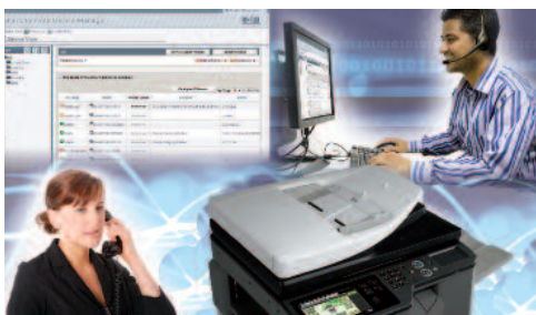
Sharp Remote Device Management

The MX-2616N/MX-3116N implements versatile device management capabilities through user-friendly software to achieve ultimate efficiency.