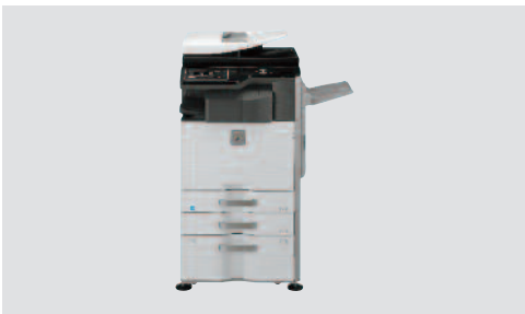
Available paper capacity stores up to a maximum of 3,100 sheets with options