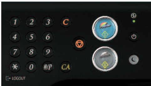
Separate print buttons for B&W and Color allow users to selectively manage use of color