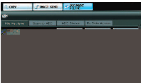
Sharp's easy-to-use Document Filing System with thumbnail preview