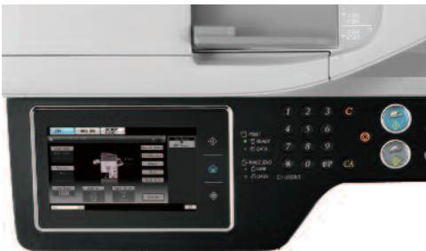
High-resolution touch screen with Stylus pen for easy point-and-touch operation